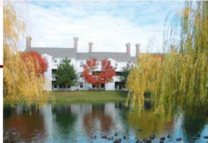
We hope you're enjoying the beautiful fall colors throughout our communities!

Lastly, just a few friendly reminders as we move toward that dreaded winter season (for some of us anyway)...please make sure that you help keep heating costs down by keeping your entry doors closed. Don't prop the building doors open at any time. Secondly, the snow will be flying soon, so please make sure you know which carport is yours so there's no confusion with your neighbors. Finally, remember that the speed limit is only 15 mph! The kids are back in school, so it's especially important that you are careful and aware when you're driving