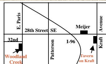
Only a Few Minutes Away!